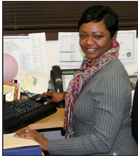
Human Resources Assistant Business Office